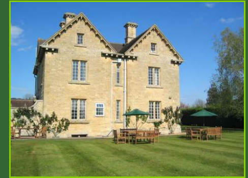
The Moretons Farmhouse - sleeps 10