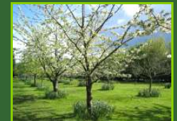
The orchard in blossom