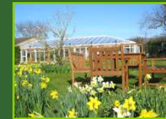
The gardens in March